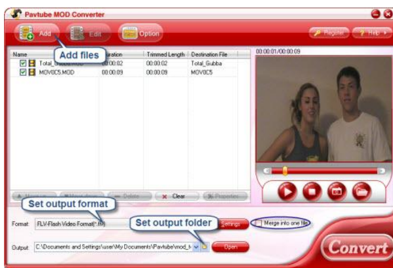
Figure 1 http://www.pavtube.com/guide/mod-to-flv_clip_image001.jpg